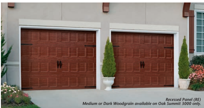
Recessed Panel (RE) Medium or Dark Woodgrain available on Oak Summit 3000 only.

Photos shown with optional decorative hardware or locks.