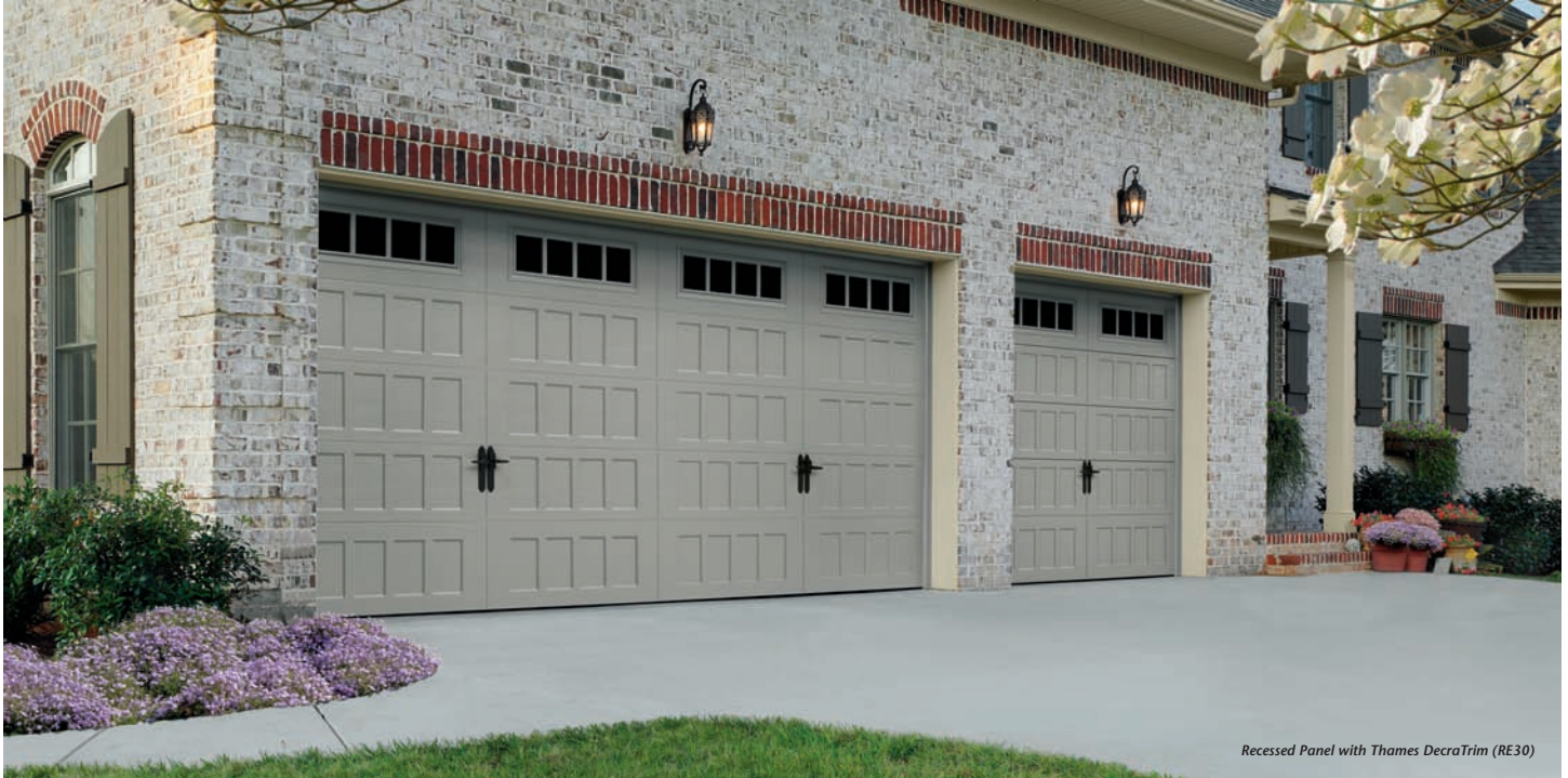
Recessed Panel with Thames DecraTrim (RE30)

Self-expression shouldn't cost a fortune. With Amarr's Oak Summit Collection, it won't. These durable steel doors offer an attractive carriage house look. Choose from a variety of door colors, decorative hardware, and window accents. Customize your home with Amarr's most affordable carriage house door.