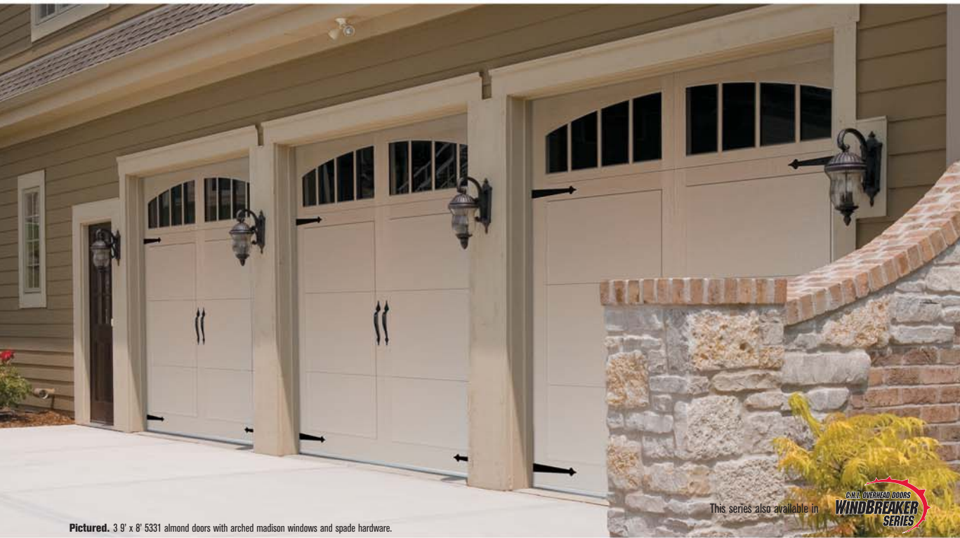
Pictured. 3 9' x 8' 5331 almond doors with arched madison windows and spade hardware.