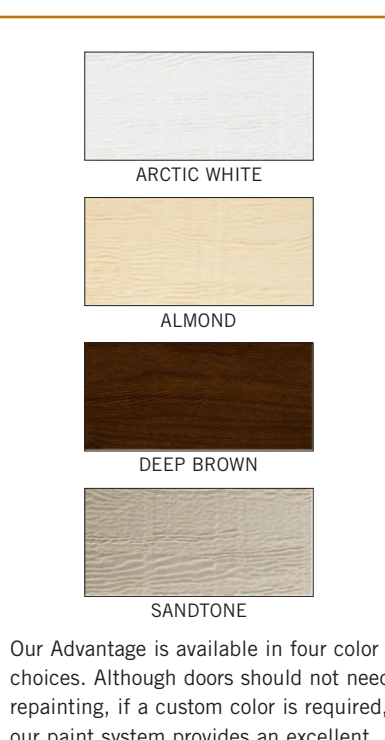
choices. Although doors should not need repainting, if a custom color is required, our paint system provides an excellent base for any field applied paint.